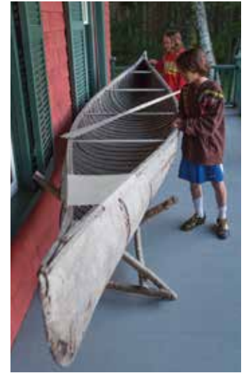
Total attendance at the Park increased 17% in 2016.

increased nine percent (9%), Tea with Eleanor ticket/group sales increased forty-two percent (42%). Sales at the gift shop were flat. The late cancellation of eight groups from one client brought Conference sales down twenty-seven (27%).