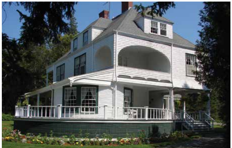
Tea with Eleanor ticket/group sales at Wells-Shober Cottage increased 42%.