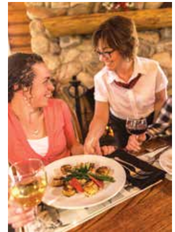
Sales at the Fireside increased 9% in 2016.