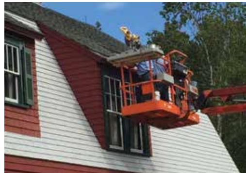
Preserving and maintaining historic properties is an ongoing process; 2016 was no exception.

The Park is currently developing an Asset Management Program. This system will monitor and maintain tangible assets such as buildings, vehicles, and infrastructure using a systematic process of deploying, operating, maintaining, upgrading, and disposing of assets cost-effectively to achieve the greatest return. Management and investment practices will be applied to physical assets with the objective of providing service in the most cost-effective manner. This includes the management of the lifecycle of physical and infrastructure assets. Operating and sustaining the Park's assets in a constrained budget environment requires prioritization to operate and maintain the Park's assets effectively. To develop this program for our infrastructure, the Park has begun to create an inventory of all its assets and infrastructure, determining current values and replacement values, and is also developing a maintenance and investment schedule which will support annual budget requests based on actual priority needs.